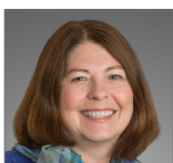
Amy Tranckino Tax

For assistance with establishing an opportunity zone fund, or for additional information regarding opportunity zone funds or opportunity zones in general, please contact the attorneys listed below.